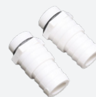
PVC connectors Ø 32–38 mm