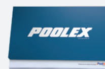
Multilingual installation and user manual